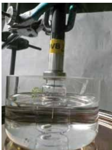
Figure 2. Detailed picture of extraction process

solution of 60% v/v acetonitrile in water for the static desorption step. The vial is held at 45°C for 20 minutes. Subsequently, the fiber is retracted and the vial is homogenized. A 25- \mu L or 50- \mu L volume of this solution is injected into the HPLC system. After each analysis, the fiber is washed with Milli-Q water to remove the residues of NaCl.