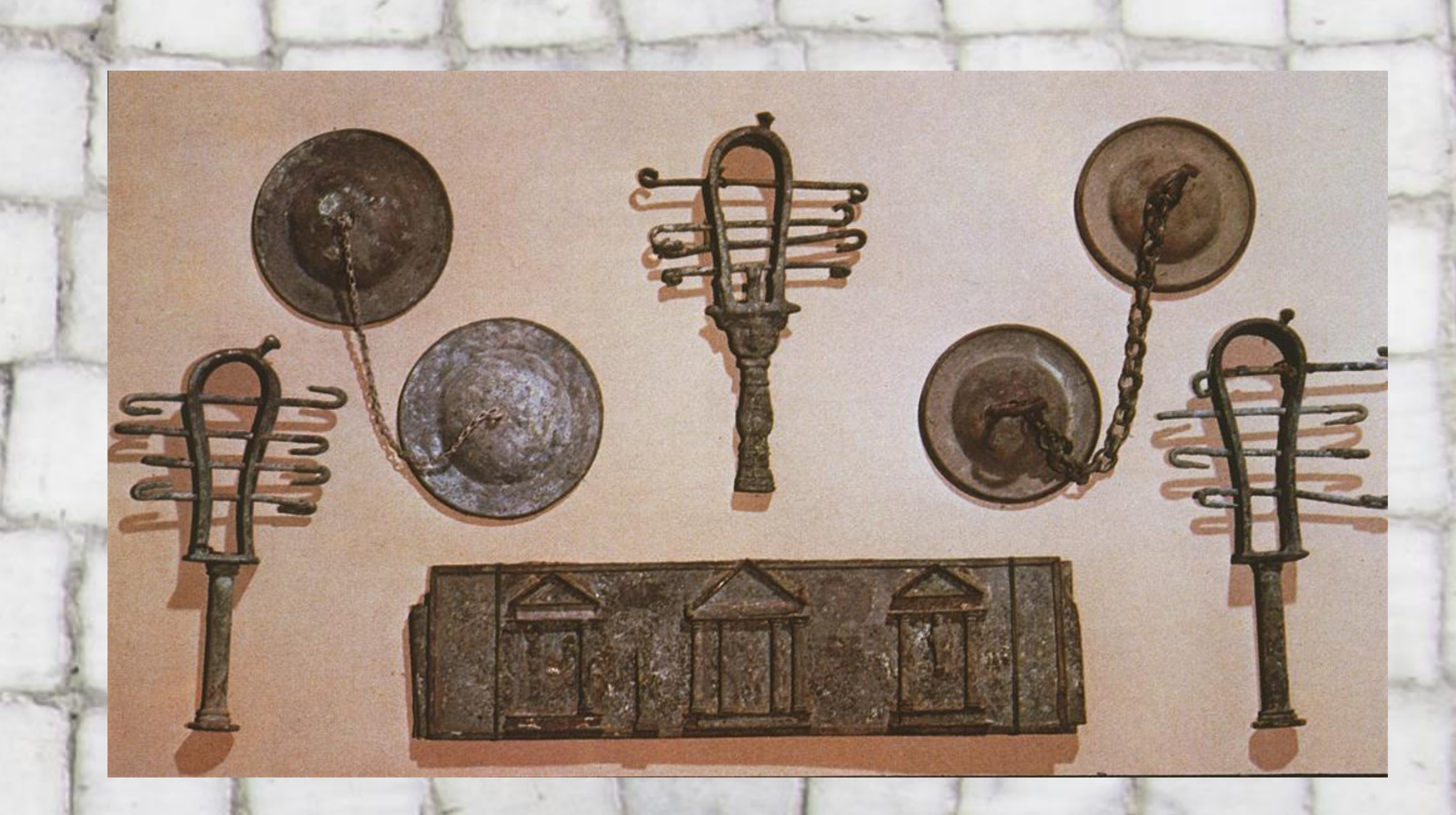
Sistrums and cymbals used during religious ceremonies