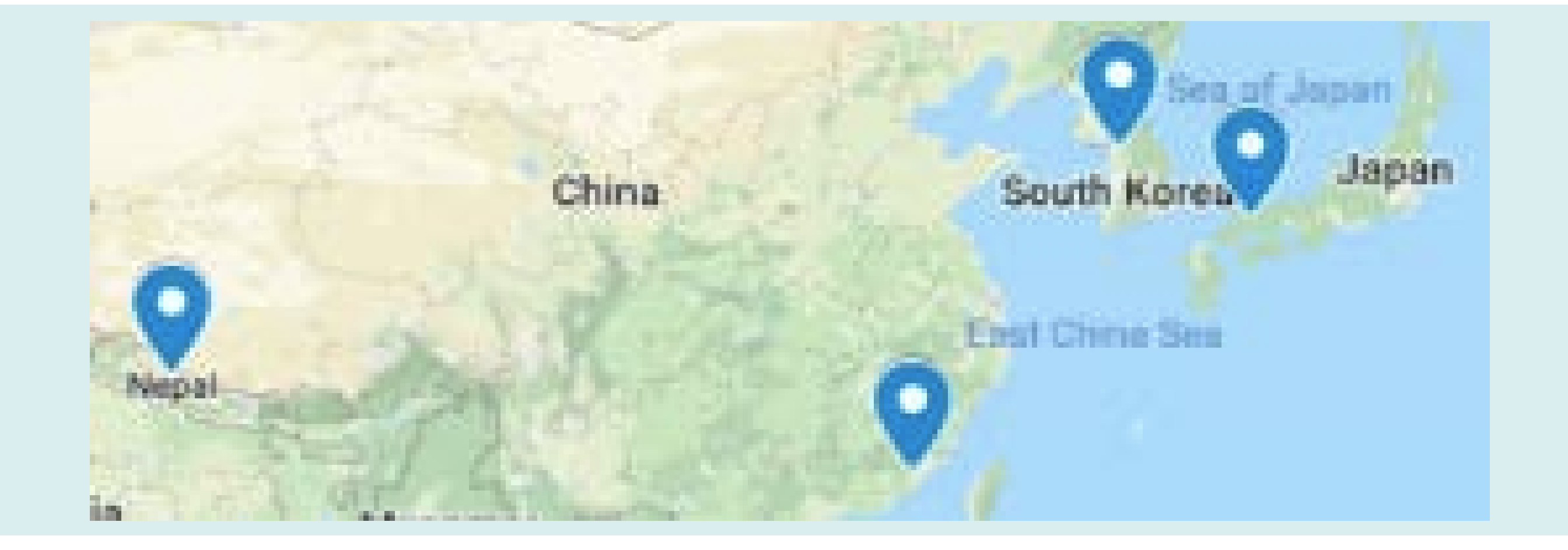
Figure 3. Map indicating the various known origins of bacterial species found in the gut contents of locally collected crayfish.