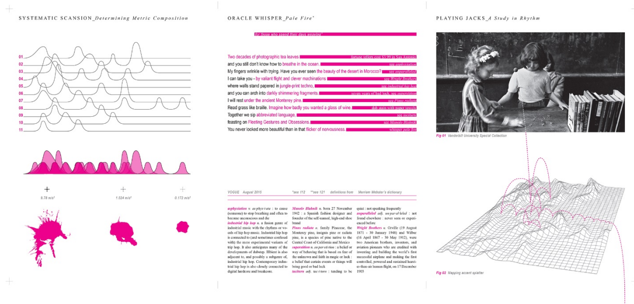
Figure 1 Kelsey Jillian. Vogue Magazine Triptych: Assignment 01 + 02. August 2017

Unlike drawing, which generally starts with the blank slate of the page, collage starts with referential source material. Through a process of literary collage, the various components are juxtaposed and reanimated in a newly assembled composition while maintaining some history of their previous life. By virtue of this process, a collage oscillates between retaining some of its original truth or patina and its new narrative infused by assemblage.