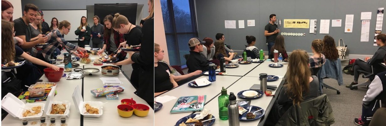
Figure 6 & 7 Students in the Time Travel for Beginners course presented their Food Timelines. On that same day each student came to class with their chosen food to share as a meal.

timeline that related to this food. As always, I encourage students to use good judgment and be open to creative interpretation. On the day when these Food Timelines were presented each student came to class with their chosen food to share. Together we enjoyed this meal. Figures F and G show images of this event.