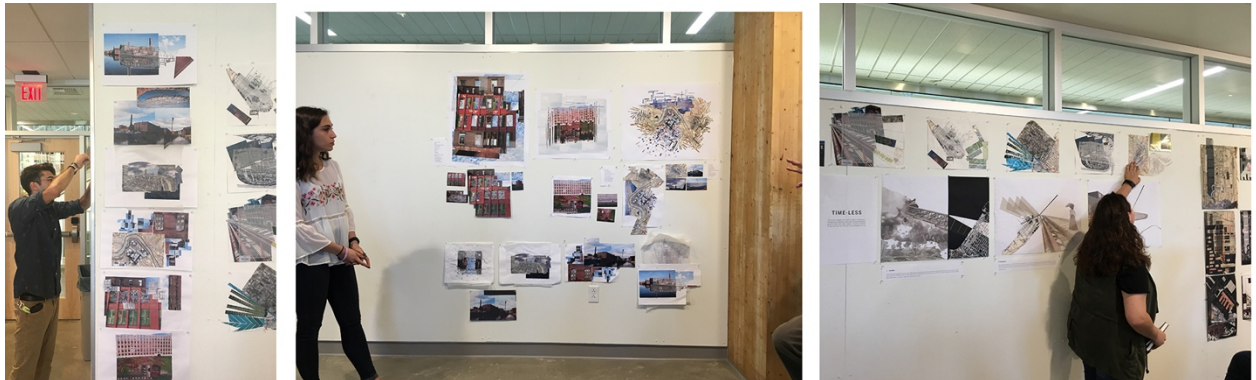
Figure 2. Students Michael Chauncey, Lara Makhlouf, and Noa Barak with pinups of their first project, Collage and Holyoke.

After a week of collecting images, students were told to identify and extract the salient parts of their pictures through tracing, isolating or cropping. Then they were asked to re-orchestrate these elements using collage, layering, trace drawing and digital manipulation. In these synthetic processes, the isolated parts became like puzzle pieces that needed to find integration through various arranging, rearranging and strategic methods for composition. This was the hardest part for the students requiring multiple iterations, many of which were unsuccessful. In the throes of frustration, students were encouraged to switch working methods– from analog to digital or vis versa. Weekly pinups of work in progress was essential, not only so that the students could receive feedback, but also so that they could see the different strategies other students were using and measure their success.