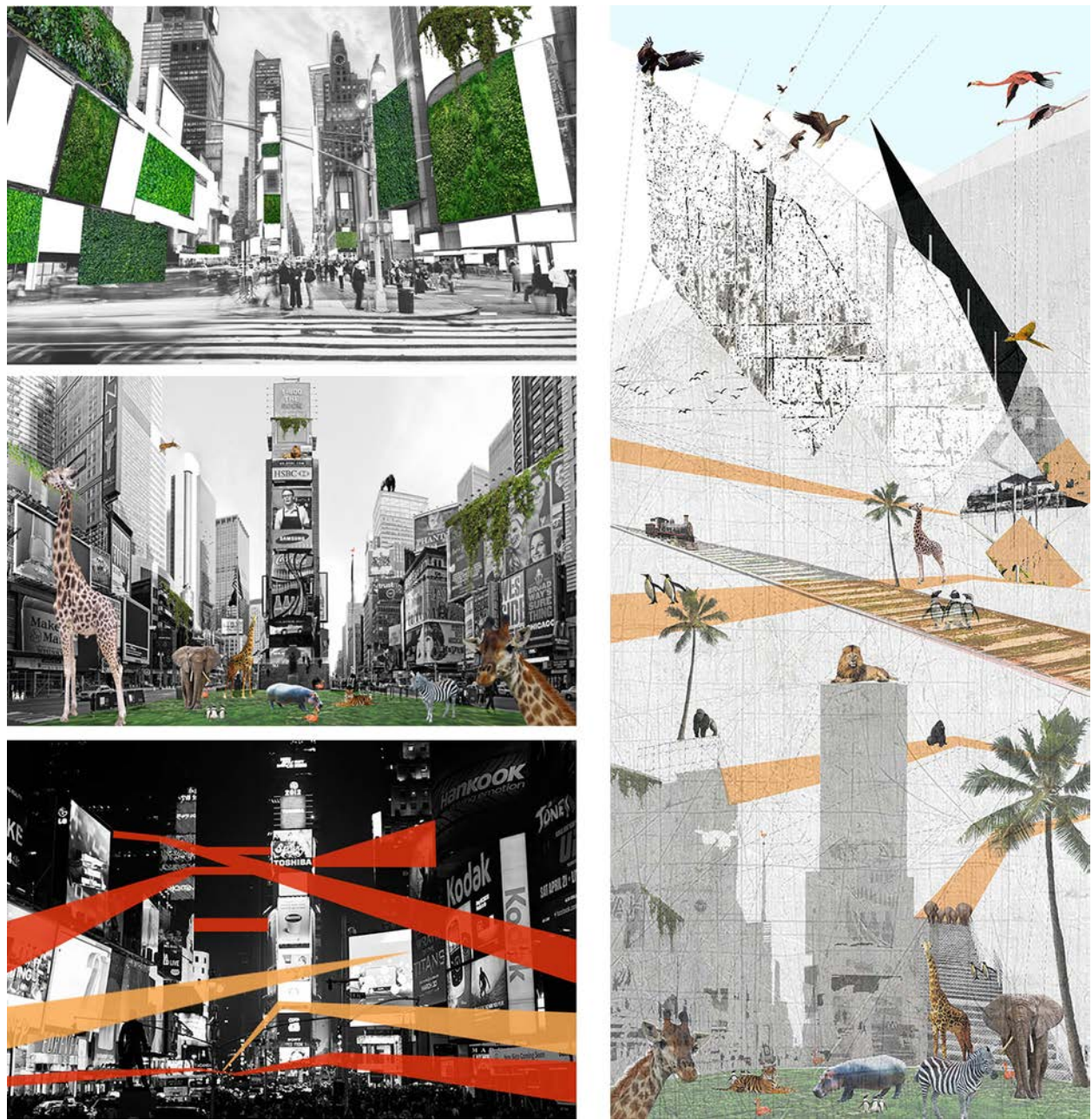
Figure 5. Student Noa Barack's Times Square Zoo. The left showing developmental drawings (11x17" each) for the vertical panorama on right (45x20").

panorama depicting a zoological habitat for wildlife. In her story, imported exotic animals and greenery took over the urban landscape of New York.