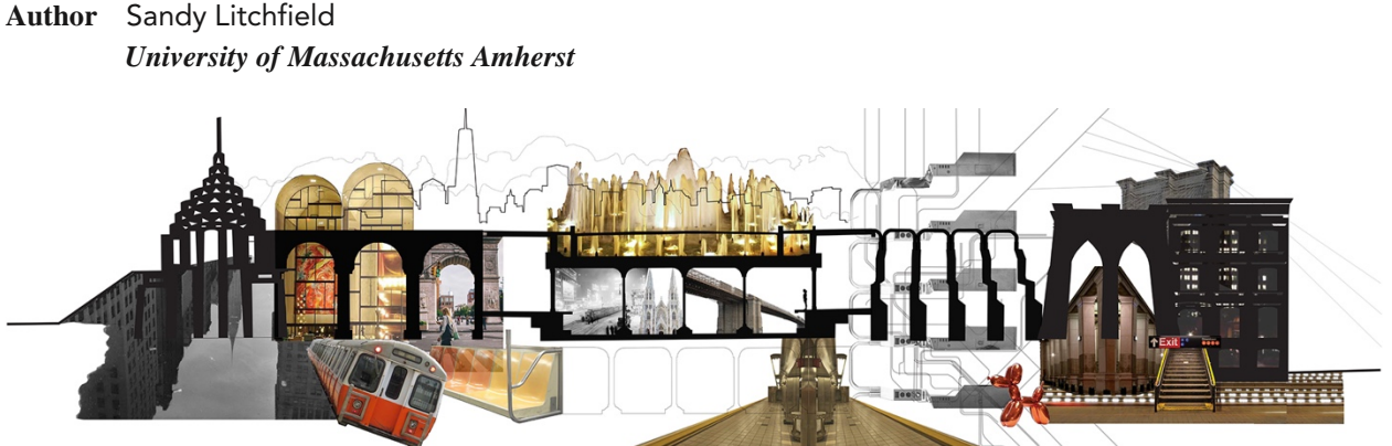
Figure 1. Student Madeline Berry's panoramic drawing of New York City

Representing the urban environment is a challenging but integral component of architecture and urban design education. As students become familiar with the process of site analysis, they must also learn to present their research through drawing conventions like perspective, plans, elevations and cross sections in conjunction with graphic diagrams and illustrations. The recent influx of digital technology and visual literacy is radically transforming these conventions, enabling designers to merge, morph and invent imaging techniques used both for analysis and communication.