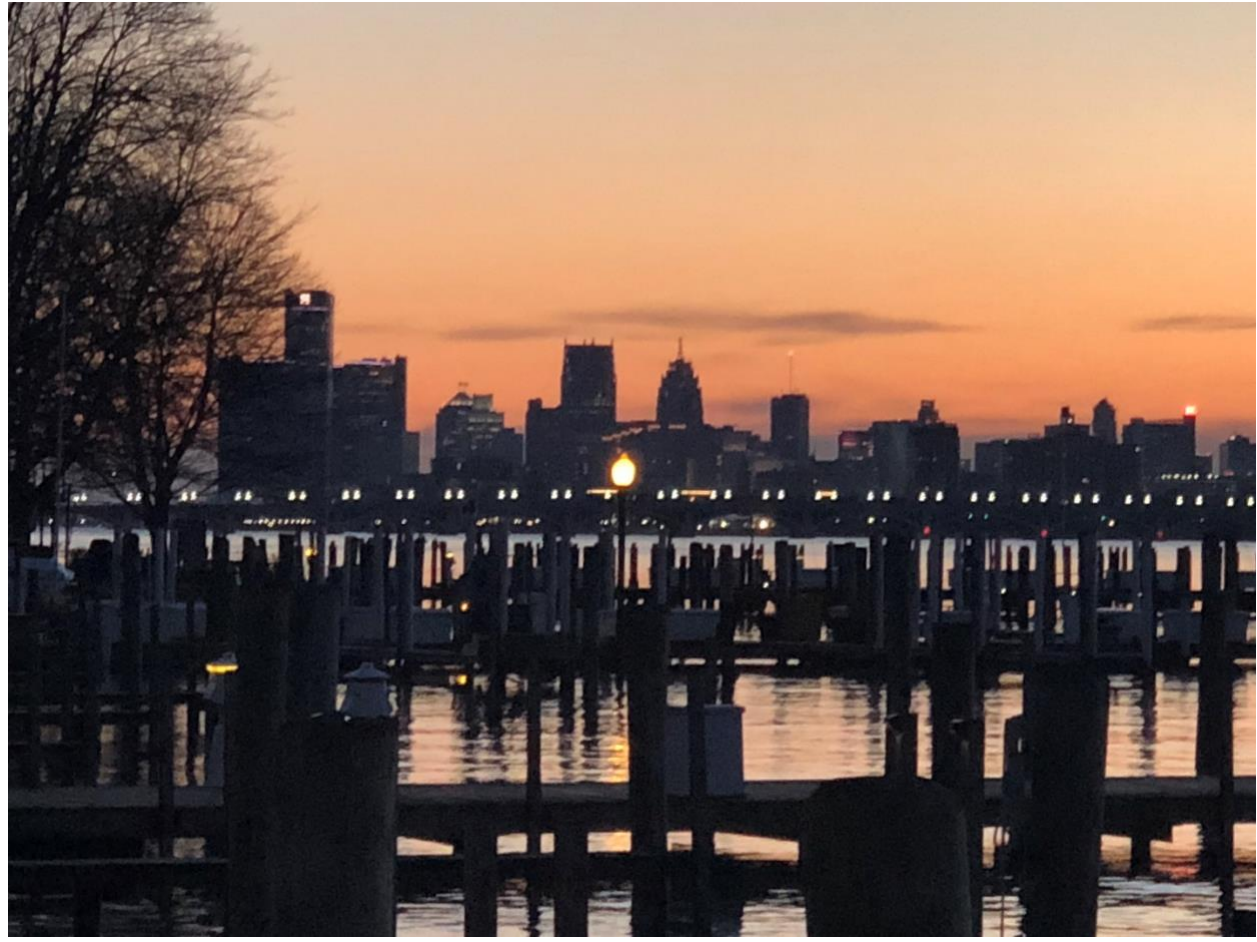
Figure 2 The Ren Cen, 2018