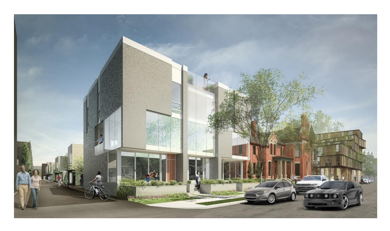
Figure 8 City Modern, Brush Park, "Bedrock Management Services LLC 2015"