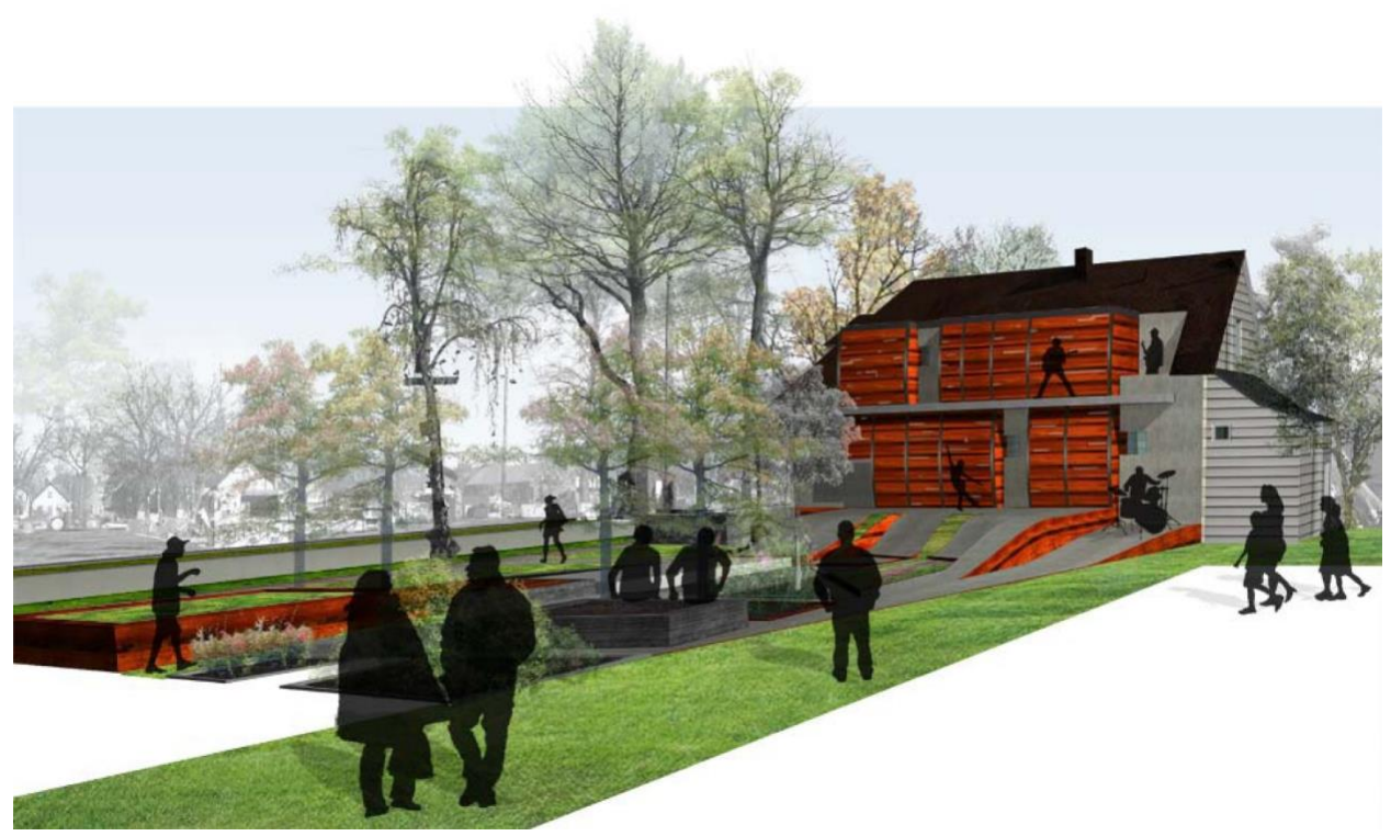
Figure 10 ©DCDC, The Play House

desolate to highly desirable, economic drivers. One example is Bedrock's City Modern, Brush Park project. The City Modern development not only layers multiple types of housing, promising to attract young families and empty nesters alike, but also will be restoring several historic Brush Park mansions and weaving those in to the newly formed urban context. "City Modern seeks to merge the enduring spirit and historic character of Brush Park with contemporary design and modern amenities fit for everyday urban living" (Brush Park Development Company, 2018). Brush Park promises to be "emblematic of our time while celebrating history". (Dittmer, 2018).