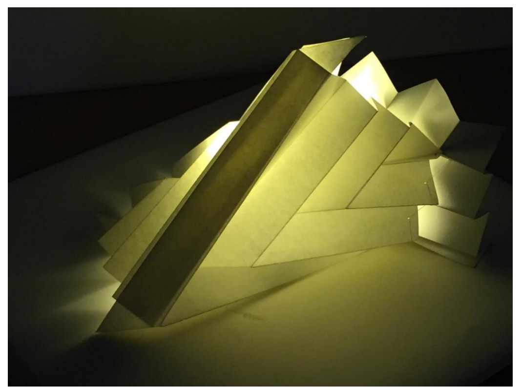
Figure 12 Angela Lazarte, student, Light Container