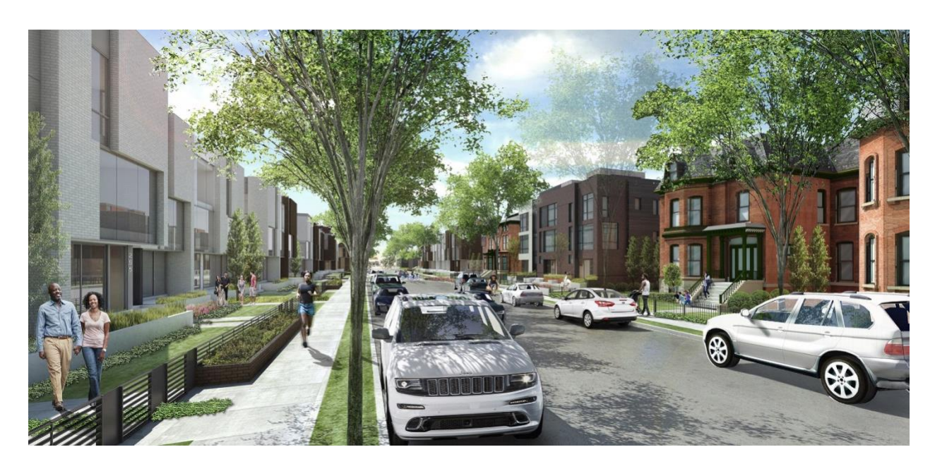
Figure 9 City Modern, Brush Park, "Bedrock Management Services LLC 2015"

Alternatively, there are huge, highly-financed infusions of Save As that promise to forever alter the downtown Detroit landscape. Bedrock Management in Detroit is investing significant financial and design resources in to developing many commercial parcels in downtown Detroit. These projects intend to be woven within already existing contexts, contributing visionary frameworks including bike sharing, mass transit and urban parks. The prioritizing of contemporary and appropriate architecture and urban design in these developments shows an unwavering confidence in the power of creating walkable, dense, and verdant spaces to transform urban life from