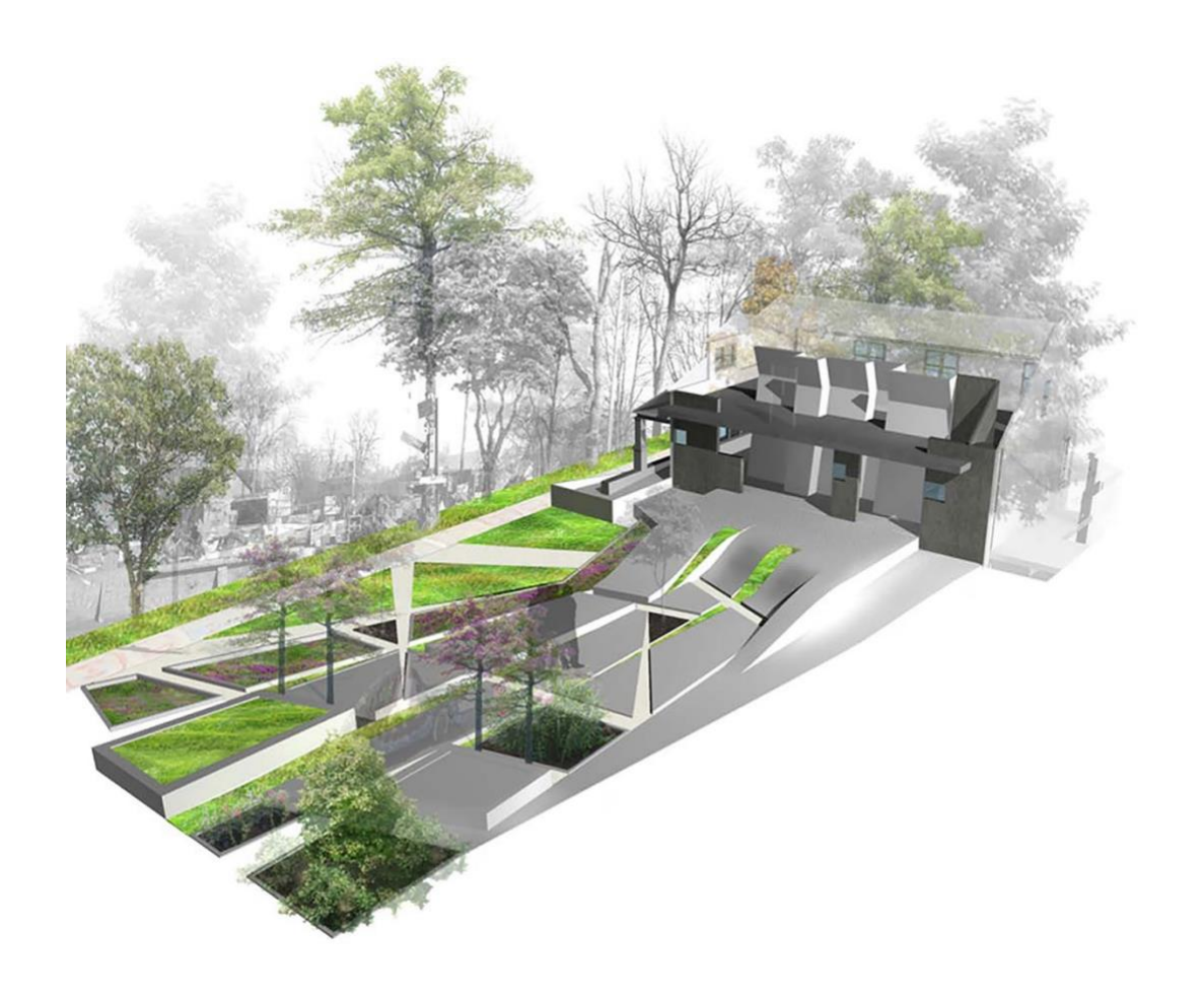
Figure 11 ©DCDC, The Play House

The Dequindre Cut Greenway & the Light House: Beacons of Community, Studio project