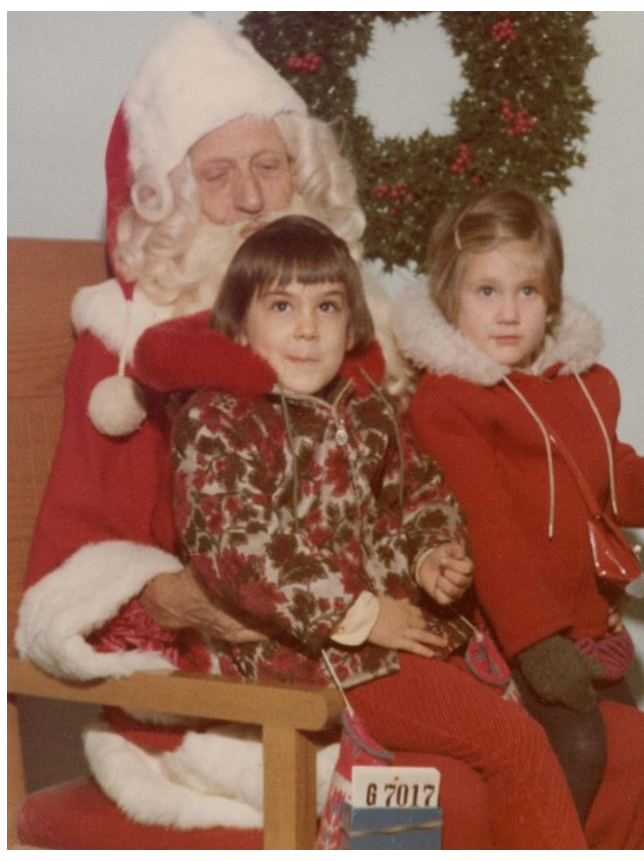
Figure 1 The author and friend, Hudson's Building, Detroit.