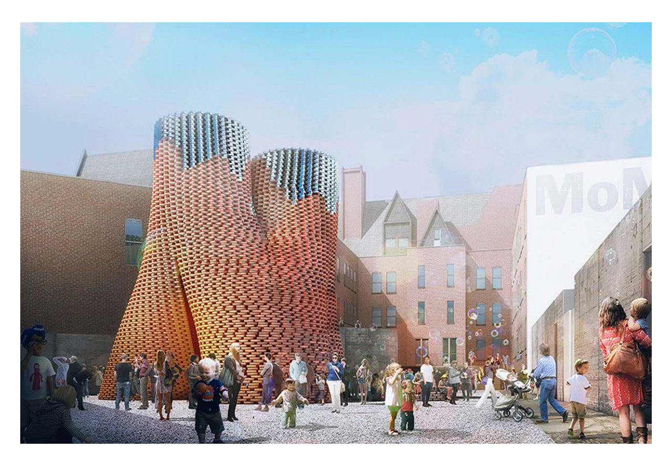
Figure 2: Hy-Fi for PS1 Moma by David Benjamin (credit David Benjamin)