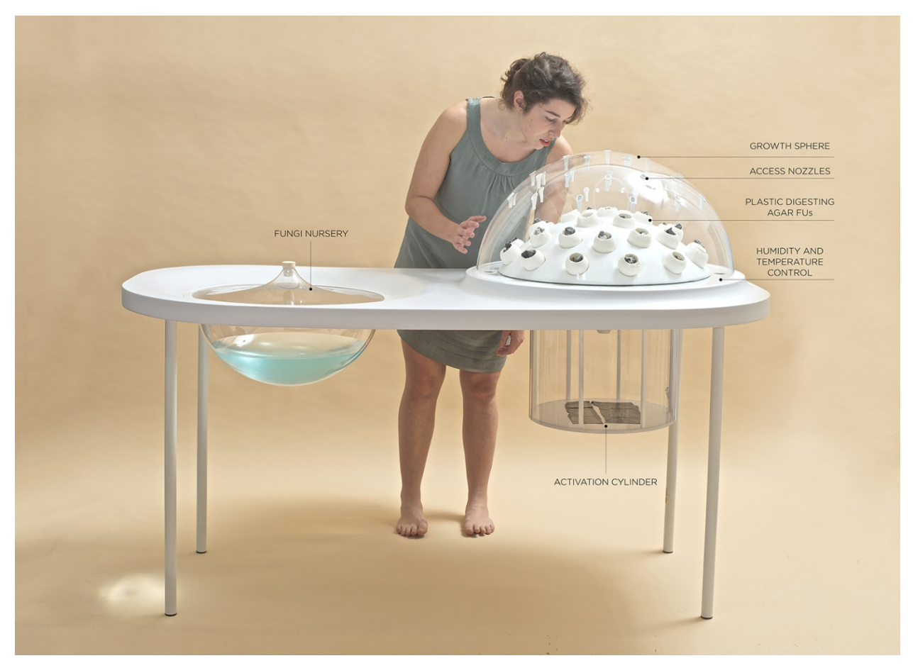
Figure 3: The Fungi Mutarium