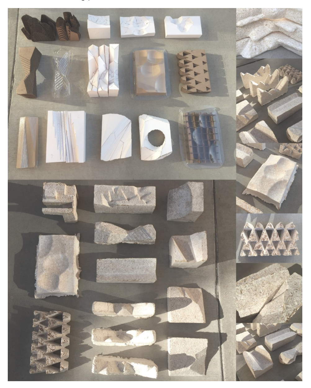
Figure 4: Final Mycelium Modules

The biggest takeaway from the project was the exposure to biological materials and the students' excitement toward future applications. During the exhibition, the atmosphere was buzzing with excitement and curiosity about what the material is and how it works. As an educator, it was rewarding to see the students educating their peers about what they learned. I found this project to be an indicator that students are open and receptive to learning about biotechnological solutions. It is imperative to educate current architecture students early on so that they feel comfortable with not only the idea of using biomaterials but also understanding that we can and must make strides to change our standards of building practices.